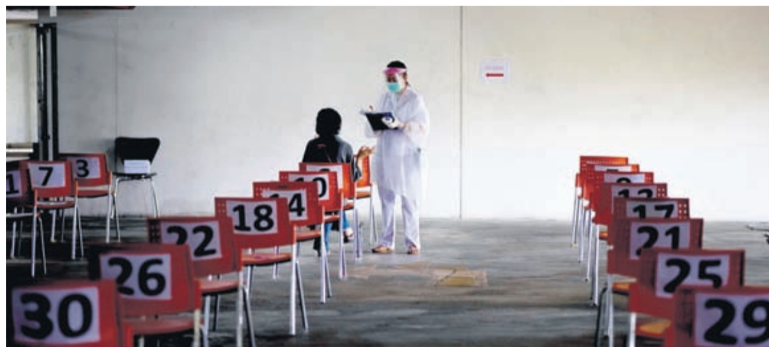
A nurse in protective clothing takes notes from a woman with symptoms of new coronavirus at a carpark that turned into a COVID-19 infection screening center at Chulalongkorn University health service center in Bangkok, Thailand, Wednesday, April 1, 2020. The new coronavirus causes mild or moderate symptoms for most people, but for some, especially older adults and people with existing health problems, it can cause more severe illness or death.

The restrictions are still not as sweeping as in some other countries, where people have been told to stay home throughout the day except for necessary tasks. Prayuth said exceptions under the curfew will